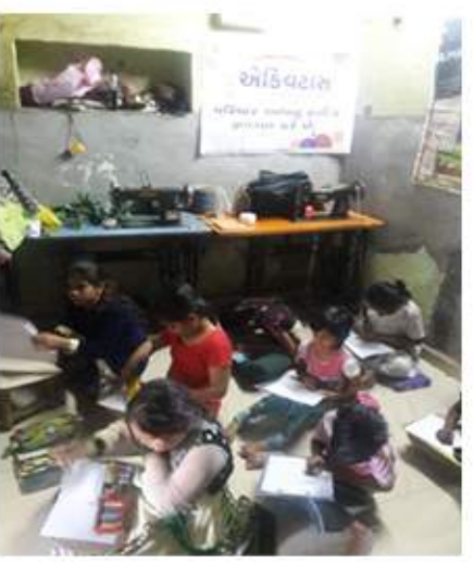
Conducted drawing competition for our member's children at Memdavad branch, and gifts were distributed to all children.