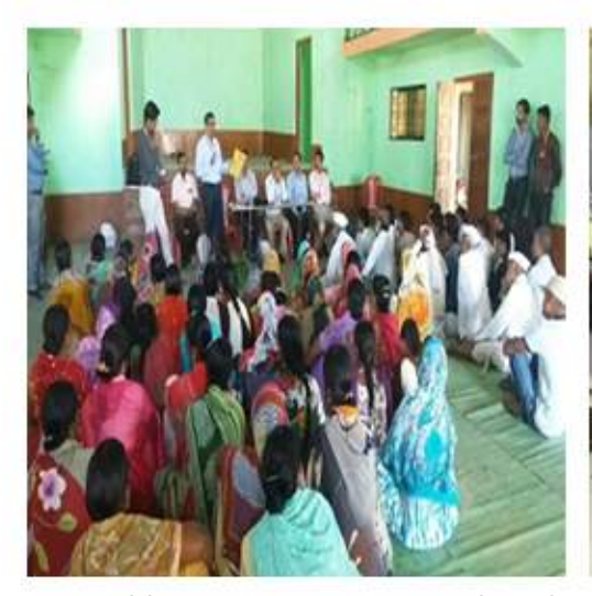
Financial literacy program was conducted for our members and their family in Osmanabad branch, Solapur.